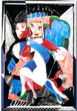
"Image of Cella", David Hockney, 1984-86. Colour lithograph with collage in frame sculpted and painted by the artist. Collection Tyler Graphics.