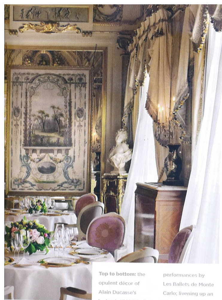
Top to bottom: the opulent décor of Alain Ducasse's Le Louis XV Michelin-starred restaurant; exhilarating