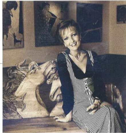
"No, no, no...! Ah no ?", 1991. 195 x 160 cm