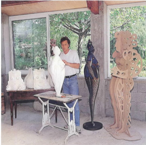
Bronze sculpture : "Poulette", 80 cm.

Unearthing and exhibiting the masters of tomorrow !