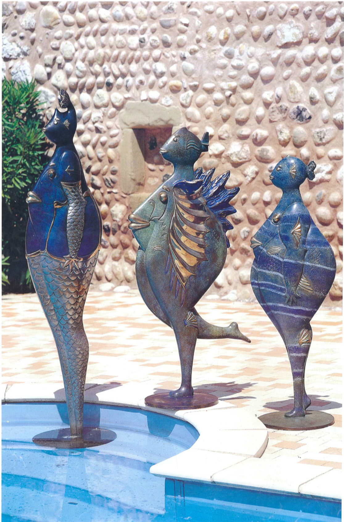
Bronze sculptures : "La grande sardine", 170 cm. "Sirène volante" 130 cm. "Sucre d'orge" 120 cm.