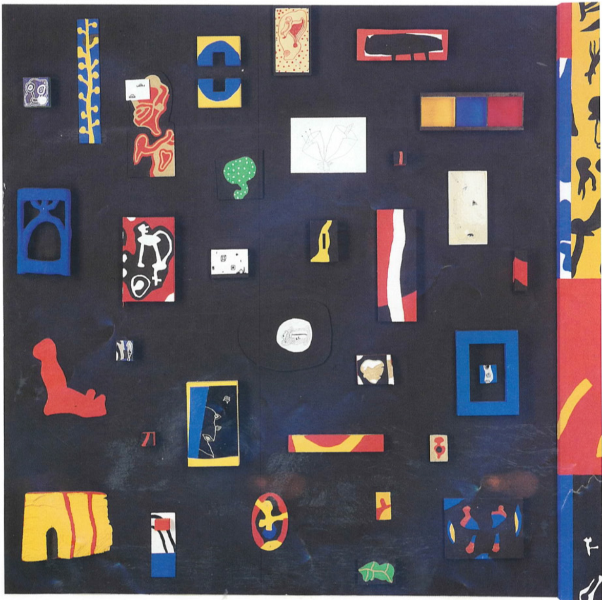
"Finites en negro", 1995. Mixed media on wood, 160 x 180 cm.

Of Spanish origin, F.M.G. is perhaps a less accessible artist, the inhabitant and portrayer of an imaginary world whose apparently non-existent structure provides a space in which he creates his own enigmatic reference points. His paintings often seem to be works in motion, which begin and end somewhere outside the canvas. They are glimpses of something difficult to discern, visual perceptions that may or may not be significant or symbolic, may or may not inter-relate. Intellectually and aesthetically, their attraction is quite magnetic, leaving a familiar impression of the fleeting nature of the universe and our own place within it.